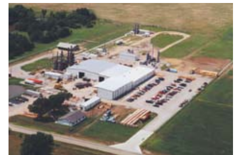
Callidus 82,000 sq. ft. manufacturing and fabrication facility in USA

The Callidus, 290 acre, R&D facility is in continual use for combustion technology research and development as well as customer witnessed demonstrations. Our array of test systems allows us to closely match actual field operating conditions, providing results which will more accurately predict actual measured performance.