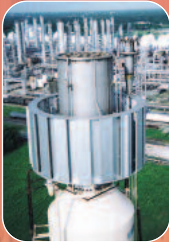
Internal Steam Flare