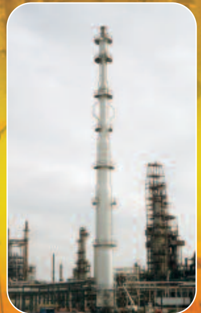
Self supported upper steam flare