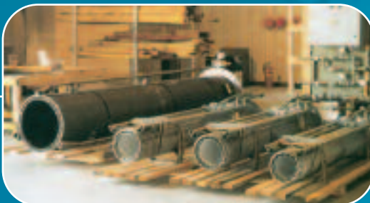
Pipe flares ready for shipping to customer location