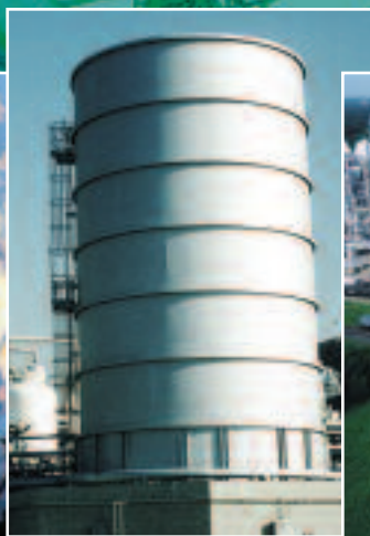
TOTALLY ENCLOSED GROUND FLARE