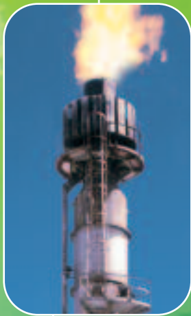
Upper steam flare