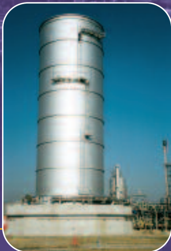
Totally enclosed ground flare