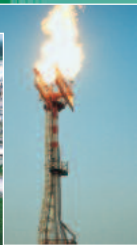
MULTIPOINT STEAM ASSIST