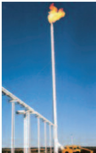
Callidus Air-assisted flare system