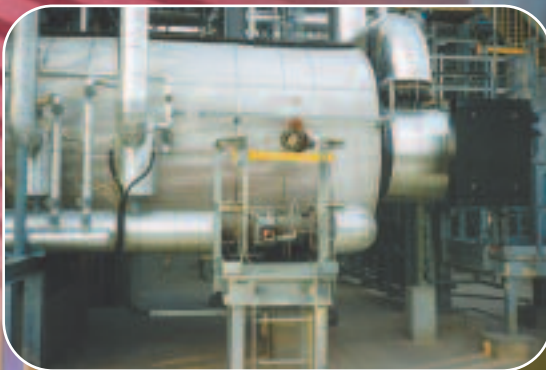
20 MM BTU/hr sulfur plant tail gas incinerator on site in U.S.