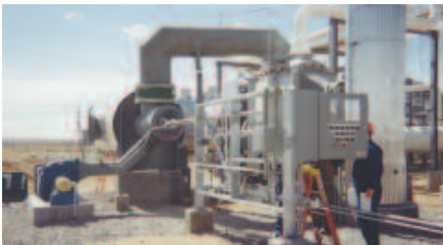
9.5 MM BTU/hr fume incinerator on site in the U.S.