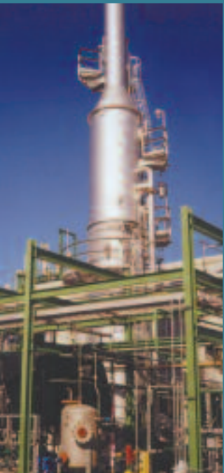
LOW NO x

Industry Leader / Compliance Driven / Certification Assured