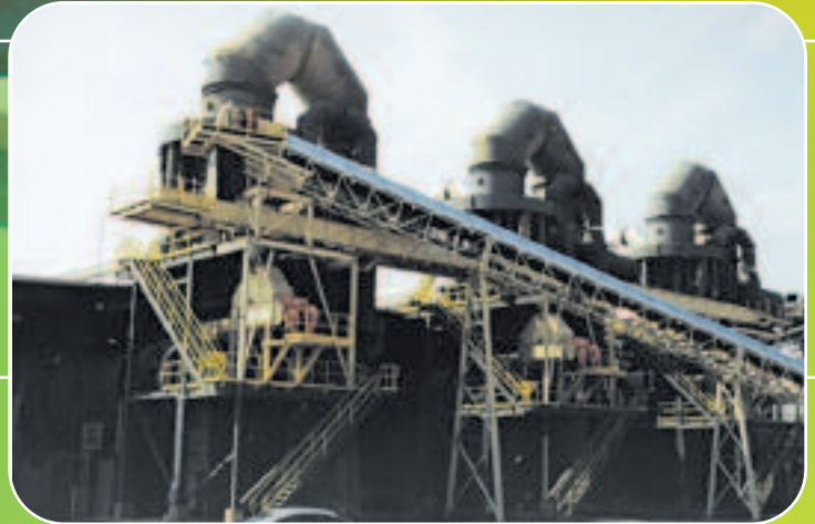
Three train rotary kiln closed loop gasification system for wood products plant in the U.S.