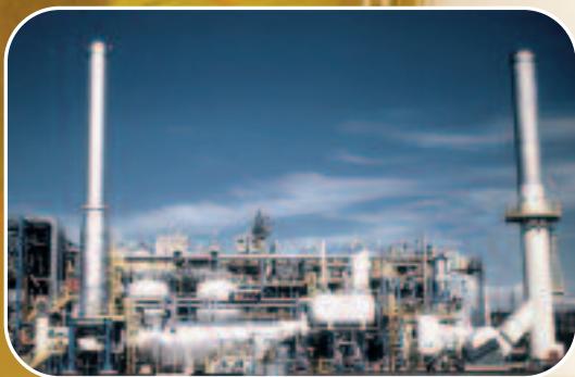
80 MM BTU/hr low NO x system on site in Europe.