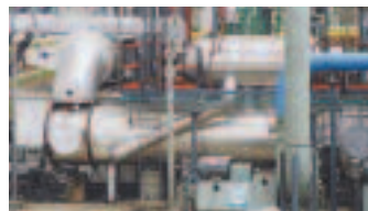
deNO x idizer/tail gas unit on site in India.

The combustion process is completed in stage three where the flue gas is oxidized at a temperature of 1700°F to 2000°F with excess oxygen present. NO x in the final flue gas typically ranges from 80 to 200 ppm, depending on the waste composition. A destruction efficiency of 99.99 percent can be achieved for most compounds.