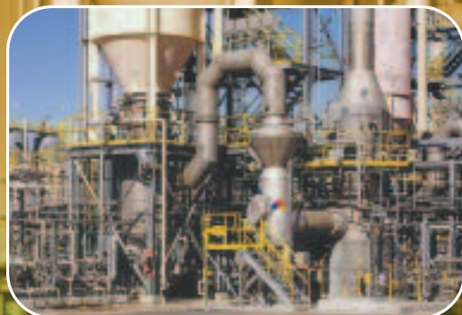
35 MM BTU/hr downfired system on site in the Middle East.