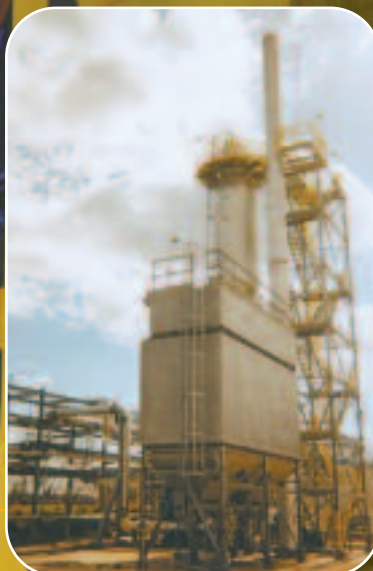
10 MM BTU/hr fume incinerator with flue gas conditioning and baghouse on site in U.S.