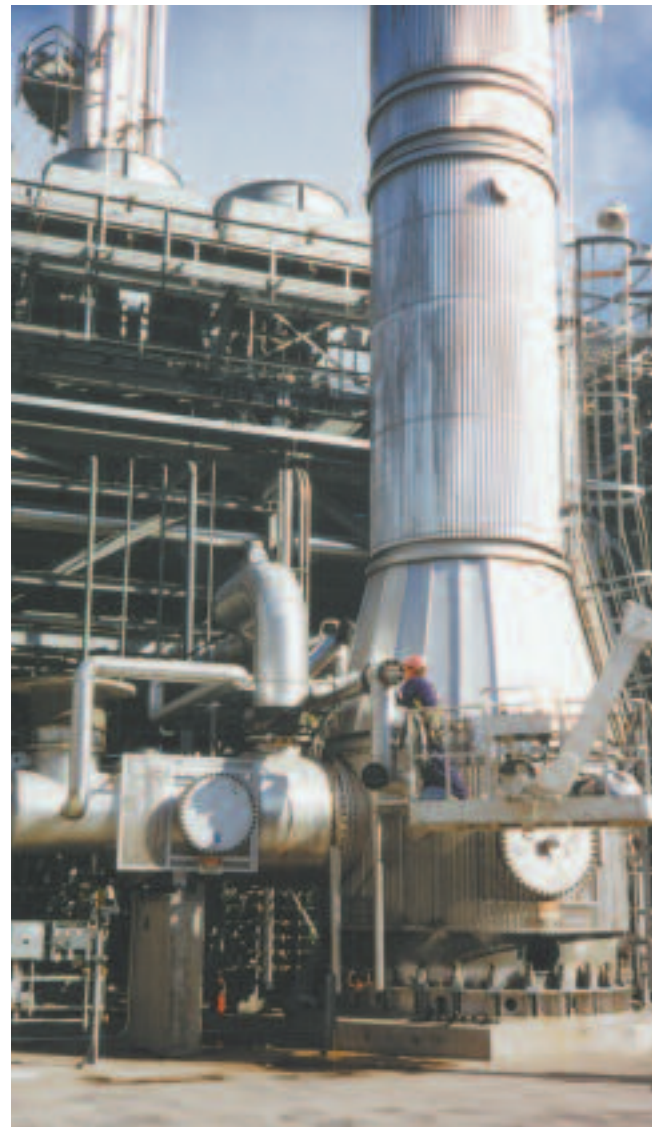
22 MM BTU/hr tail gas unit on site in the U.S.

Generally, regulations require H 2 S in the flue gas to be 10 ppmv or less; but in certain cases, levels as low as 2 ppmv are required.