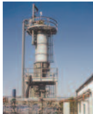
Industrial scale thermal oxidizer and data acquisition center