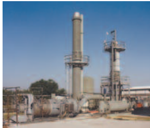
Thermal oxidizer research and development center

Our research and development facility investment and capabilities, along with our dedication to quality and continually improved incinerator school, underscores Callidus' commitment to being the leader in the worldwide environmental and combustion industry. We don't just follow the standards - we set them.