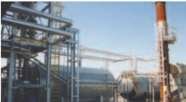
15 MM BTU/hr fume incinerator on site in Europe

Destruction efficiencies greater than 99.99 percent may be required for some organic wastes. This is achieved by operating the oxidizer at a higher temperature with minimal auxiliary fuel. Waste heat boilers or hot oil heaters can be used downstream to recover heat for other plant operations.