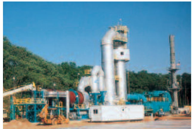
Soil remediation rotary kiln on site in U.S.

Upgrading our manufacturing and fabrication facilities is an ongoing process at Callidus. Our fabrication facilities employ the latest manufacturing practices and equipment. As a global leader in the thermal oxidizer market, much of our fabrication occurs in strategic locations around the world. Proprietary items are fabricated in our own shop. This approach makes good economic sense, and provides our customers the best value for their combustion system.