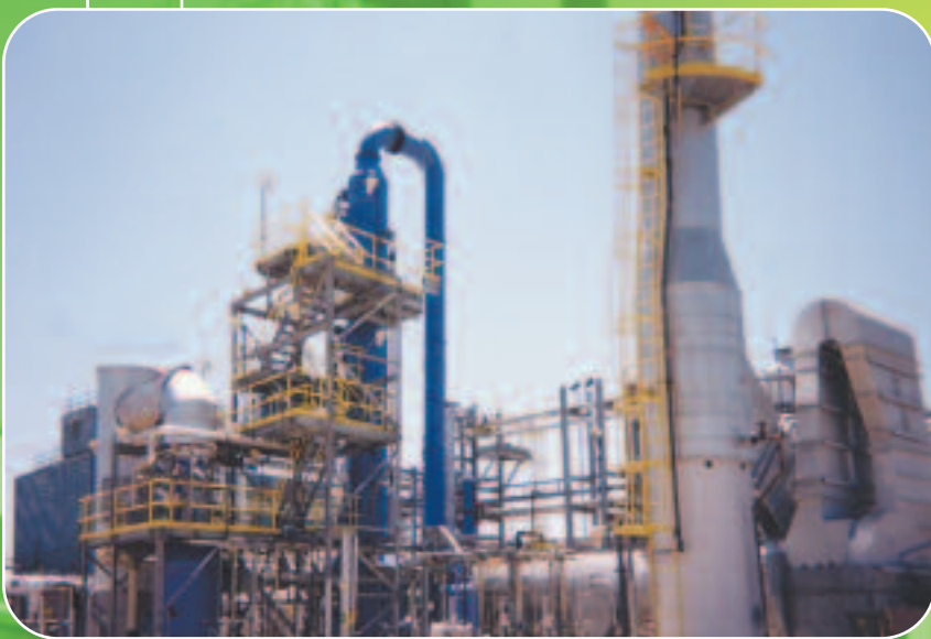
8 MM BTU/hr brominated waste unit on site in the U.S.