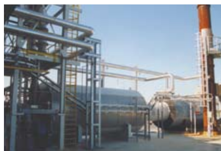
15 MM BTU/hr fume incinerator