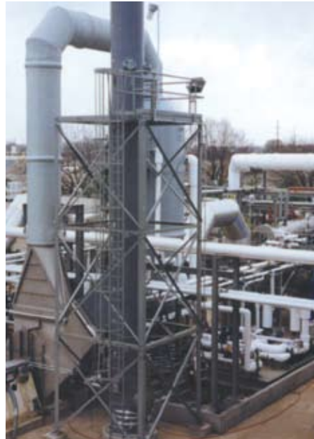
Halogenated Waste Thermal Oxidizer

2200°F with residence times of 1.0 to 2.0 seconds depending on the destruction efficiency required.