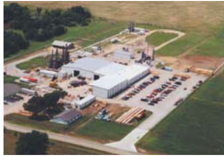
Callidus 82,000 sq. ft. manufacturing and fabrication facility in USA

The Callidus test facility is in continual use for combustion technology research and development as well as customer witnessed demonstrations. Our array of test systems allows us to closely match actual field operating conditions, providing results which will more accurately predict actual measured performance.