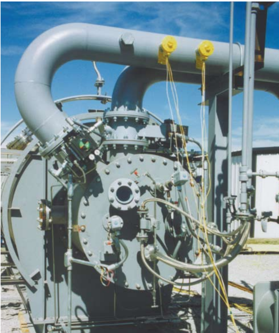
Reducing furnace burner at Callidus' research facility

Our R&D facility investment and capabilities, along with our dedication to quality and continually improved incinerator school, underscores Callidus' commitment to being the leader in the worldwide environmental and combustion industry. We don't just follow the standards - we set them.