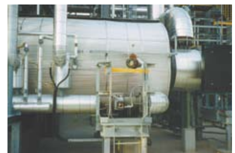
20 MM BTU/hr sulfur plant tail gas incinerator