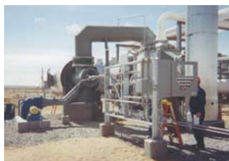
9.5 MM BTU/hr fume incinerator

Destruction efficiencies greater than 99.99 percent may be required for some organic wastes. This is achieved by operating the oxidizer at a higher temperature with minimal auxiliary fuel. Waste heat boilers or hot oil heaters can be used downstream to recover heat for other plant operations.