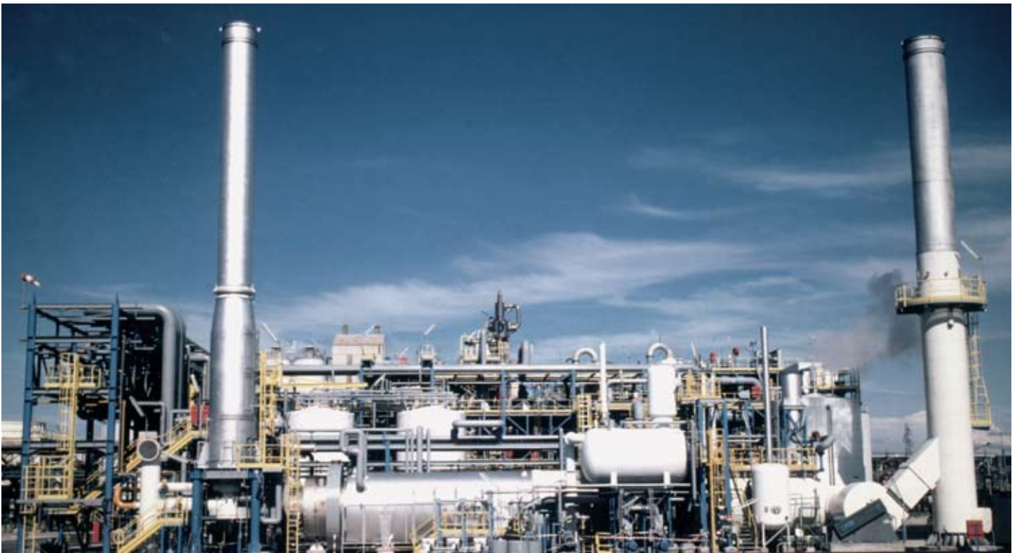
80 MM BTU/hr low NO x system