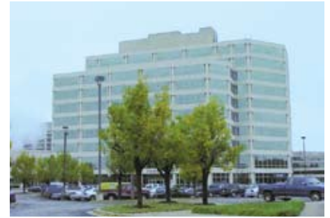
Callidus headquarters - Tulsa, Oklahoma. USA