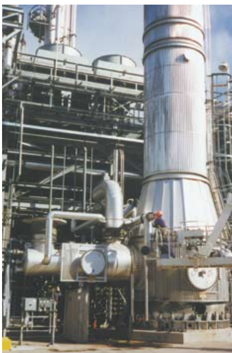
22 MM BTU/hr tail gas unit