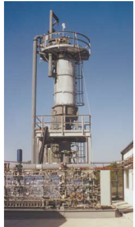
Downfired oxidizer in Callidus research facility