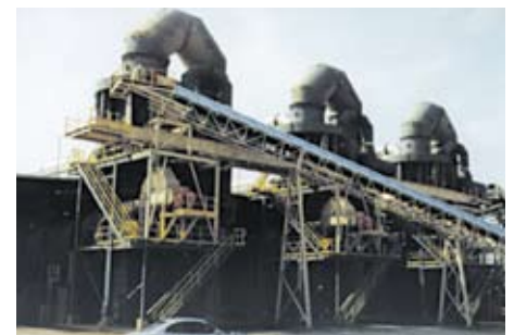
Closed loop gasification system for wood products plant