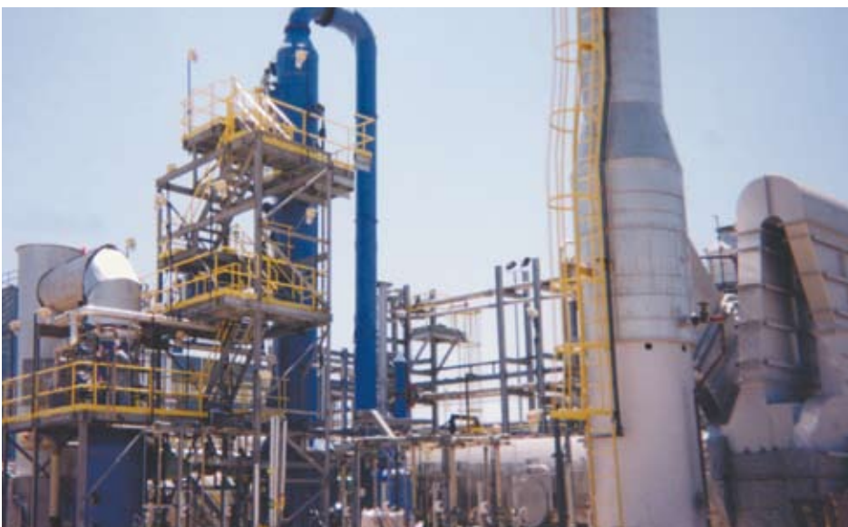
8 MM BTU/hr brominated waste

As a global leader in the thermal oxidizer market, much of our fabrication occurs in strategic locations around the world while proprietary items are fabricated in our own facilities. This approach makes good economic sense, and provides our customers the best value for their combustion system.