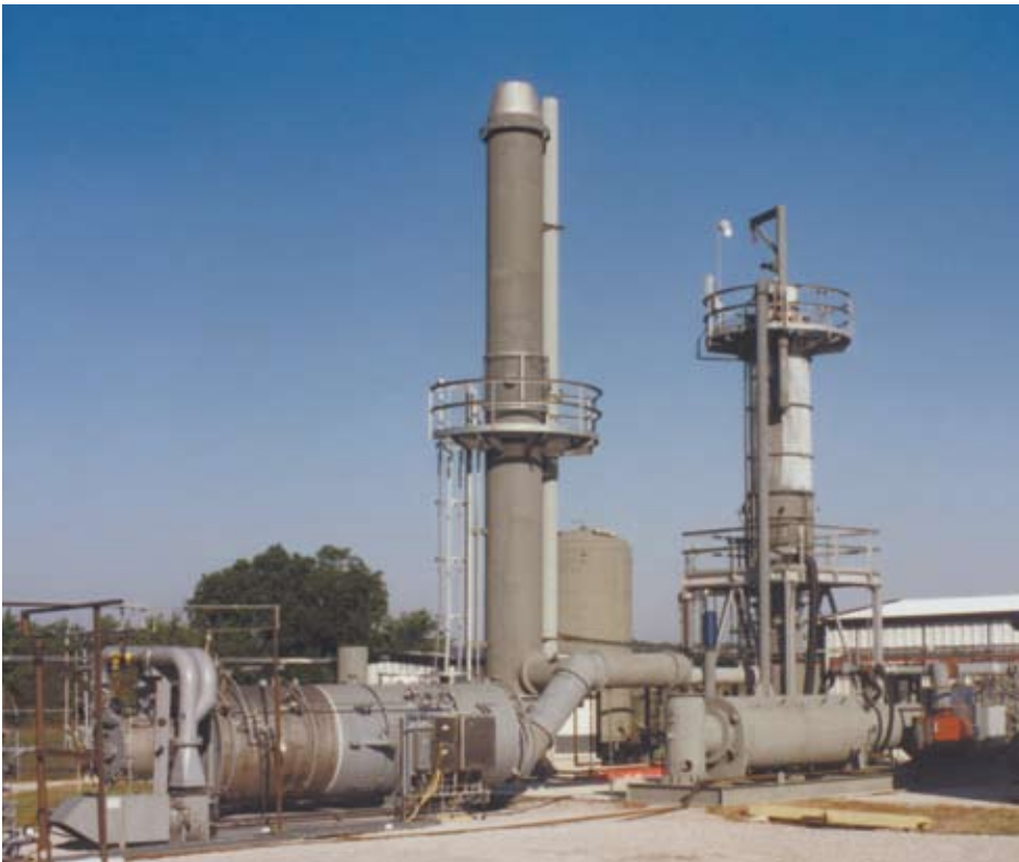
Three stage combustion system at Callidus research facility