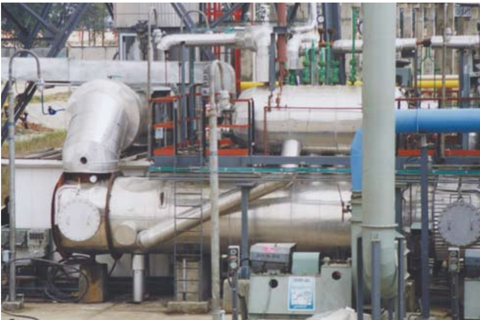
deNOxizer/tail gas unit